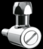
Quick coupling filter tap connector