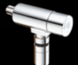
Quick coupling tap connector