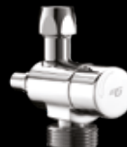
Quick coupling double washing machine tap connector